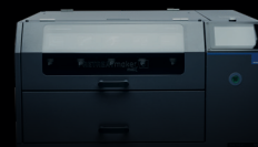
PRETREATmaker max 5